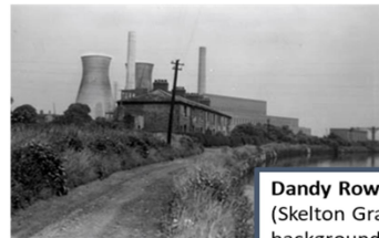
Dandy Row – workers' cottages (Skelton Grange Power Station in the background was built in the 1950s)

Due to their dilapidated state, the old mill buildings were demolished and rebuilt at a cost of £15,678. As well as a new mill, outbuildings, workers' cottages and the mill tenants' house were constructed by 1825.